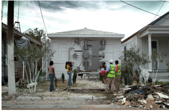
Mel Chin, SAFEHOUSE 8th Ward New Orleans, 2008–2010. Courtesy of the artist