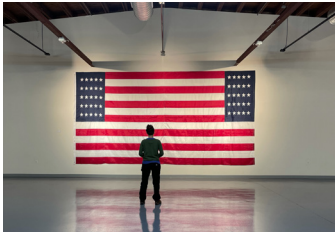
Mel Chin, Flag of America , 2021.