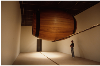
Mel Chin, SPIRIT , 1994.