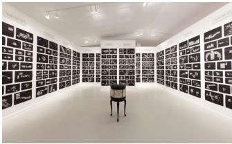
Mel Chin, The Funk & Wag from A to Z , 2012. Courtesy of the artist