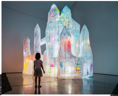
Leah Wulfman Salt Lake City, UT