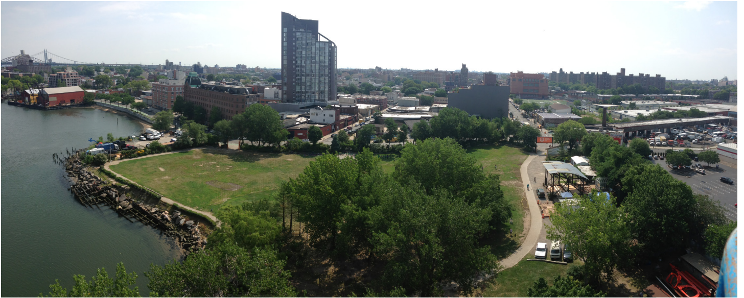
Socrates Sculpture Park, Long Island City, Queens, NY